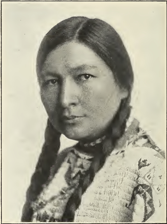
ZITKALA-SA (Gertrude Bonnin) A Dakota Sioux Indian